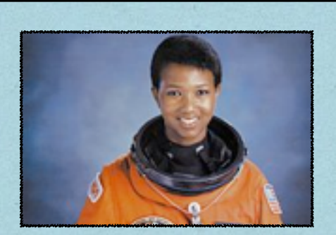
SPOTLIGHT: Mae Jemison; the first black female astronaut in space in 1992. She loves dancing and even had an appearance as an actress on an episode of Star Trek.