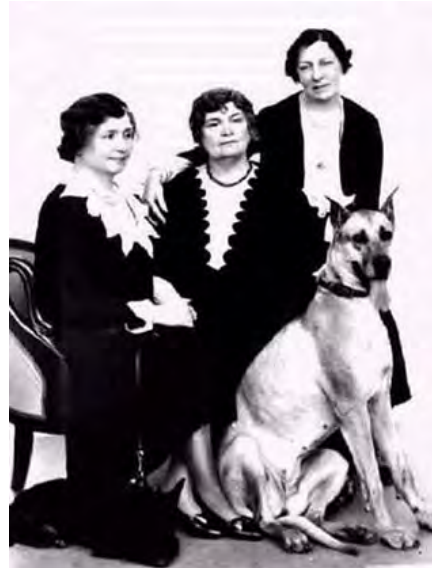
Helen, Annie & Polly

Helen lived with them in Massachusetts, where she became interested in various social causes and, in fact, became a member of the Socialist Party, much to the chagrin of her many admirers. Soon Annie and Helen were traveling around the country giving lectures and telling Helen's story. Annie's devotion to Helen became a strain on her marriage. By 1914, John and Annie separated permanently, although they never divorced. In 1915, a Scottish woman named Polly Thomson joined the household, serving as Helen's secretary. A few years later, in order to make money, Annie and Helen took to the vaudeville circuit. In their act, Annie showed the audience how she taught Helen to read and talk. They toured for three years. Annie's eyesight continued to fail and by 1933 she was completely blind. On October 20, 1936, at the age of 70, Annie died at their home in Forest Hills, New York. Her cremated remains were interred in Washington's National Cathedral.