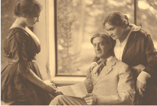
Helen, John Macy and Annie at home

By 1900, Helen had learned so much she entered Radcliffe College. Sullivan attended classes with her, spelling the instructors' lectures into Keller's hand and reading textbooks to her for hours. While they were there Annie met an instructor named John Macy. They fell in love, and after Helen's graduation in 1904, they married.