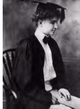
Helen at Radcliffe